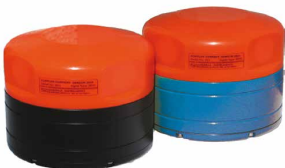
Aanderaa Current Sensor