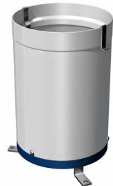
Tipping Bucket Rain Gauge